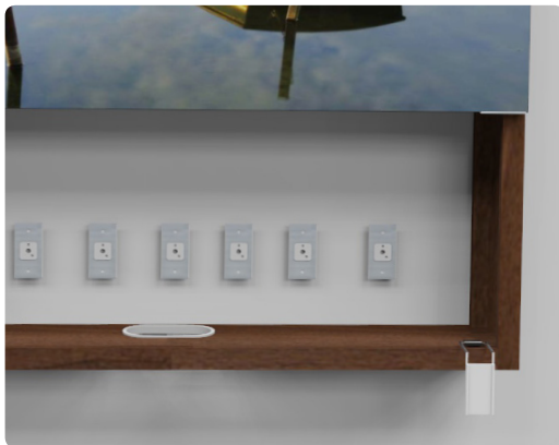
Leads, gas taps and other medical equipment are hidden from patient view behind a sliding panel made of Corian®

DuPont™ Corian® solid surface provides long-lasting durability. The flush, single panel made of Corian® gives dirt and grime no crevices in which to hide, make cleaning quick and easy. The panel is solid throughout so there's no laminate to chip or peel.