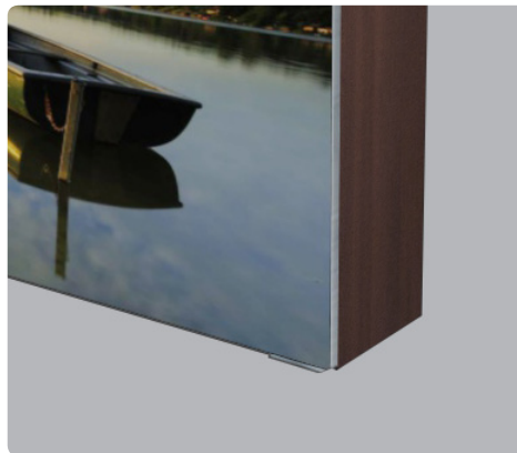
Anodized metal frame flush panel with tab handles