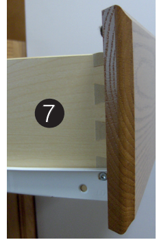
HANDICAP BASE CABINET CONSTRUCTION (32½" Height) STANDARD and DOMESTIC Option